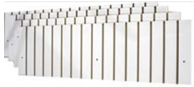
(4) Wing Panels