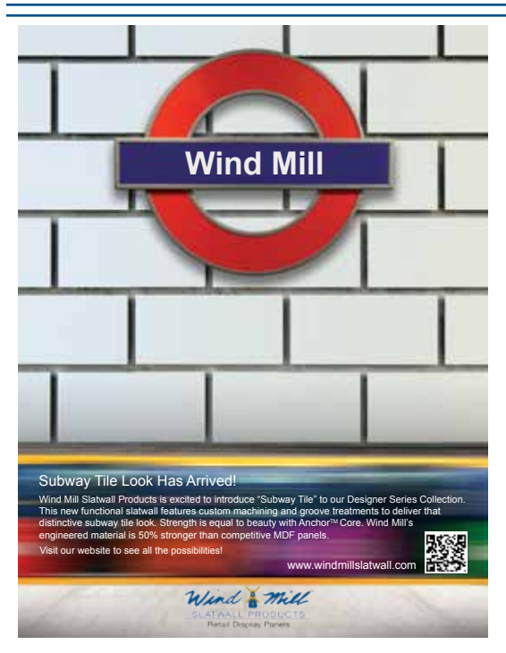
Ad from the July/August issuse of Shop! Retail Environments