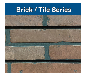
Brickyard<sup>™</sup> Painted Black Grooves Anchor<sup>™</sup> Core