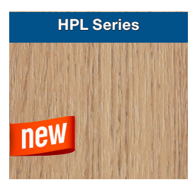
Custom HPL Formica, HardStop™ Decorative Protection "Millennium Oak"