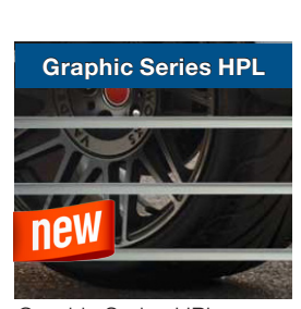
Graphic Series HPL Slatwall Digitally Printed HPL Anchor™ Core