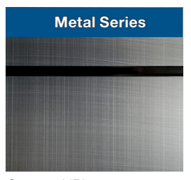
Custom HPL Graphite Aluminum, T-Sert™, Black Anchor™ Core