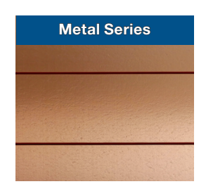
Custom HPL Copper Aluminum, T-Sert™, Custom Anchor™ Core