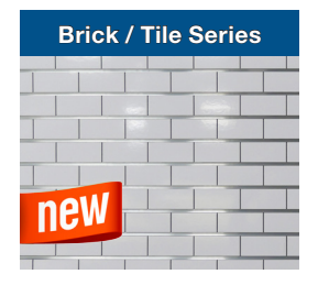
SUBWAY Tile Custom HPL, Gloss White 3" On-Center Aluminum, T-Sert™ Anchor™ Core