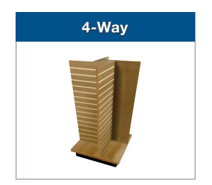
Ready-to Assemble (RTA) 3" On-Center Melamine, Birch Also Available In White, Black, And Cherry Anchor™ Core