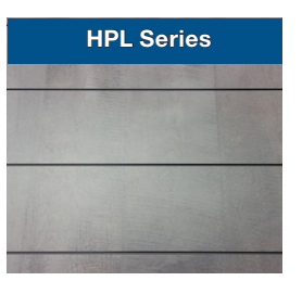
Custom HPL Concrete Formwood Plastic, T-Sert™, Grey Anchor™ Core