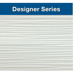
3D Vinyl, White Anchor™ Core