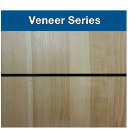
Rustic Hickory Custom Veneer Custom Clear Aluminum, T-Sert™, Black Anchor™ Core