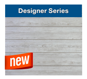
Ship Lap Barn Board, Melamine