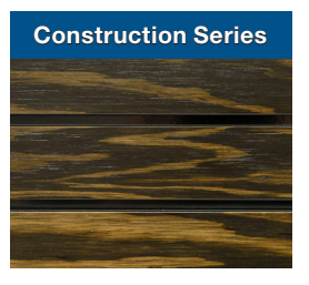
Plywood Black Stain Aluminum, T-Sert™, Black Anchor™ Core