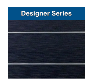
3D Vinyl, Black Aluminum, T-Sert™ Anchor™ Core