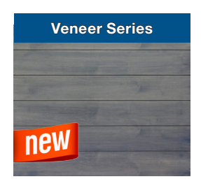
Ship Lap Maple Veneer Custom Paint, Whitewash Anchor™ Core