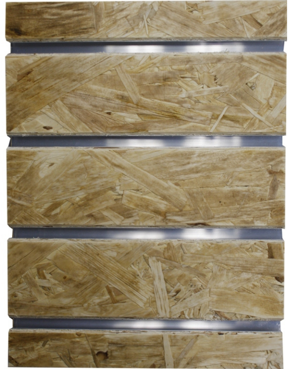
Clear coated OSB with metal groove