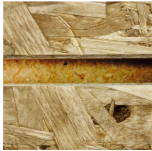
OSB with plain groove

Its rugged look is perfect for that outdoor, or sporting goods retail environment. Optional aluminum inserts in your choice of color, will add beauty and strength. OSB slatwall will accept stain or paint, and looks great with our clear finish option.