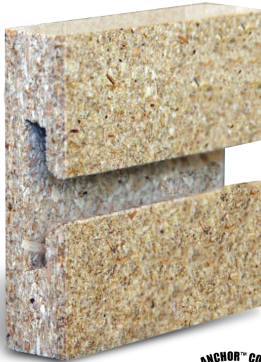
ANCHOR™ CORE SLATWALL 50% Stronger

For more information visit: www.windmillslatwall.com or call 800.548.7528.