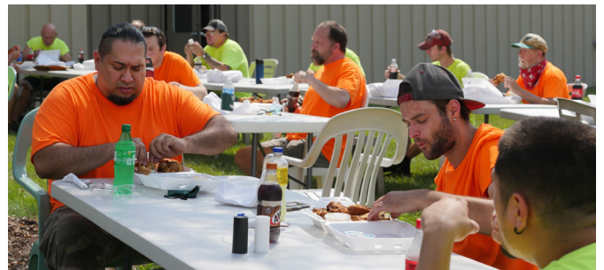
Employees enjoy a broasted chicken lunch

www.windmillslatwall.com/recent-projects