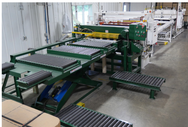
New HPL Layup Line

The Combination of Amerhart's new Sheboygan Falls facility and Wind Mill's expanded manufacturing capabilities will assure the continued growth of Formica in the region.