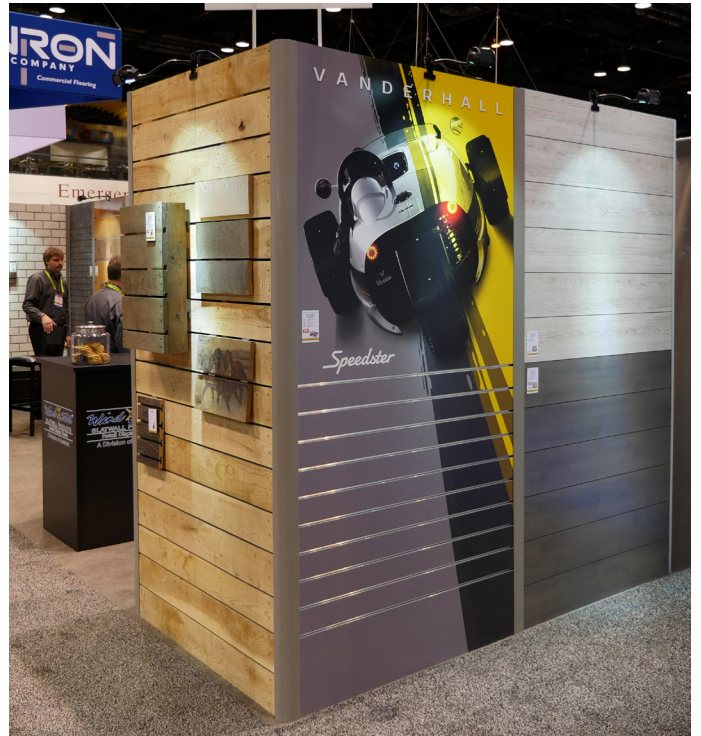
Graphic Series HPL & Shiplap

Subway tile continues to capture the imagination. Our new gloss HPL treatment features painted vertical scores and aluminum inserts. The results look so real, we had many attendees asking if we use ceramic tile. White is only one of many possible color options available in this stunning high gloss laminate. Aluminum inserts can be custom painted to match or left raw as displayed for a striking contrast.