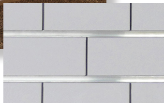
White Gloss Subway Tile

Subway tile continues to capture the imagination. Our new gloss HPL treatment features painted vertical scores and aluminum inserts. The results look so real, we had many attendees asking if we use ceramic tile. White is only one of many possible color options available in this stunning high gloss laminate. Aluminum inserts can be custom painted to match or left raw as displayed for a striking contrast.