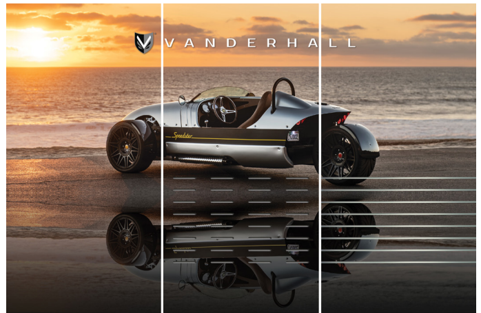
Solid Panels | DASHwall™ | Custom Slatwall

Graphic Series HPL utilizes a new technology which prints directly to high pressure laminate. This process delivers vivid colors, ultra-high resolution and great durability.