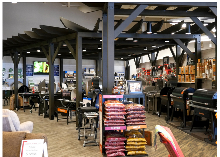
New Pergola Style Grill Area

"Slatwall gives us the flexibility to show it, to display it better, not hide it and people can shop it. We're driving more footprints in and it's going to be more profitable over all for us."