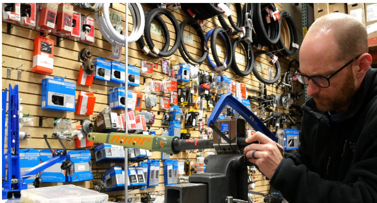
Attitude Sports Service Area