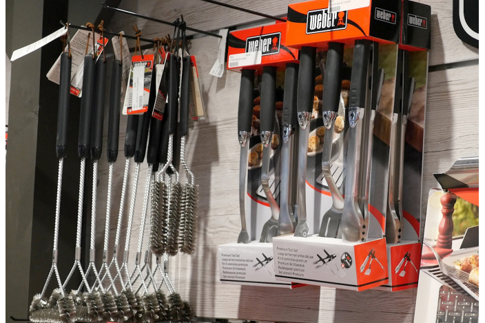
Custom Barn Board Slatwall

"We've sold grills for over 40 years. Generally, when you have grills you have free standing, ugly pegboard accessory racks that's given to you by the manufacturer. We wanted to show more accessories and the way to maximize that is to